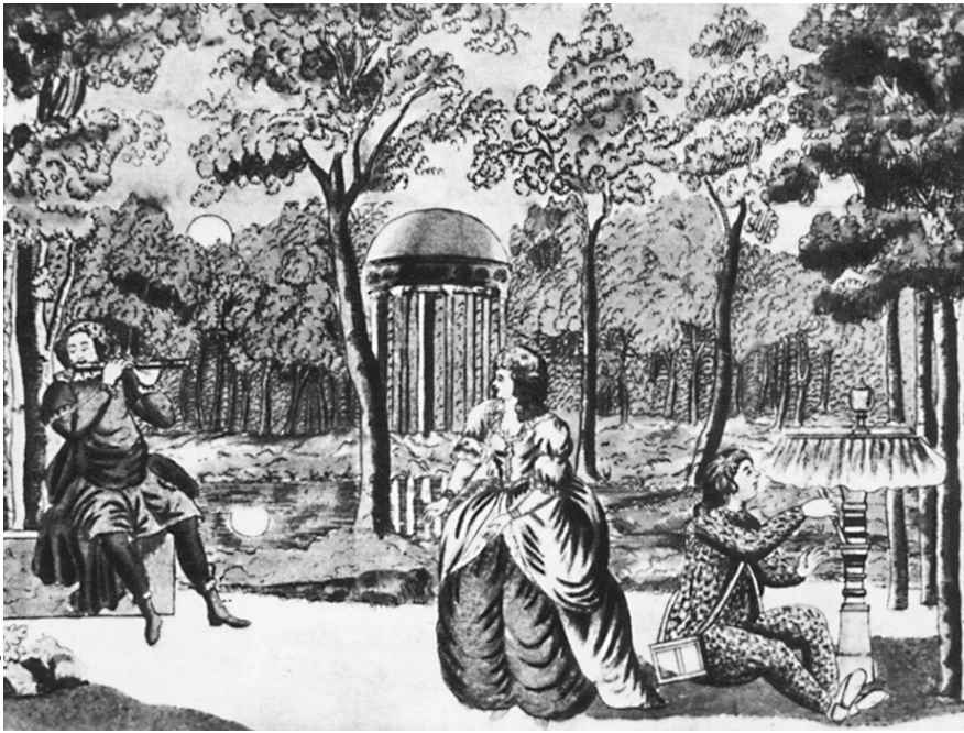
Scene from Mozart's "The Magic Flute."

quality culture to the working-class audience of the Theater auf der Weiden. However, the way in which Mozart uniquely transformed the same basic array of talent and material into his 1791 opera The Magic Flute , puts into perspective his leadership role. Schikaneder's troupe never again afterwards reached the heights of its political and artistic success of the Fall of 1791, nor could it recover from the elimination of Mozart, nine successful weeks into the opera.